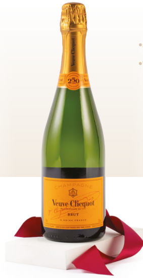
Veuve Clicquot Yellow Label Brut NV £47.99

Instantly recognisable by the iconic yellow label, Veuve Clicquot's NV is our bestselling Grande Marque fizz. Rich, toasty, generous – it's a benchmark Champagne.