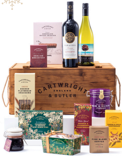
Crate of Delights Hamper £110 (in wooden crate)

Know someone who appreciates the finer things in life? The Crate of Delights includes everything they need for a memorable festive season.