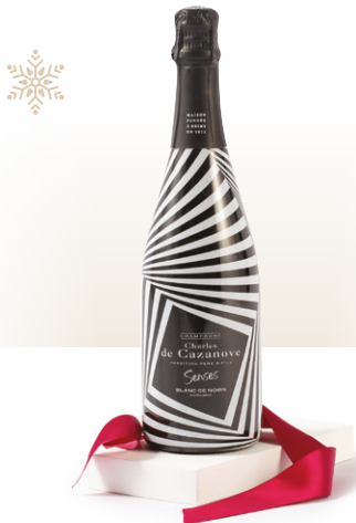
Charles de Cazanove Senses NV £29.99

A superb Blanc de Noirs Champagne that's got it all – visual appeal, enticing aromas and satisfying taste. Plus the bottle changes colour with the temperature. Now that's cool!