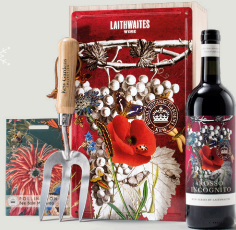
Kew Gardening & Red Wine Gift Set £40 (in wood/tin box)

Green-fingered gardeners will love this unique gift comprising a stainless steel weeding fork, a packet of Bee Balm seeds and the Kew Series by Laithwaites red wine.