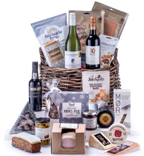
Snowflake Hamper £185 (in wicker basket)

Here's a ram-packed hamper that's bound to make a big impression on anyone lucky enough to receive it.