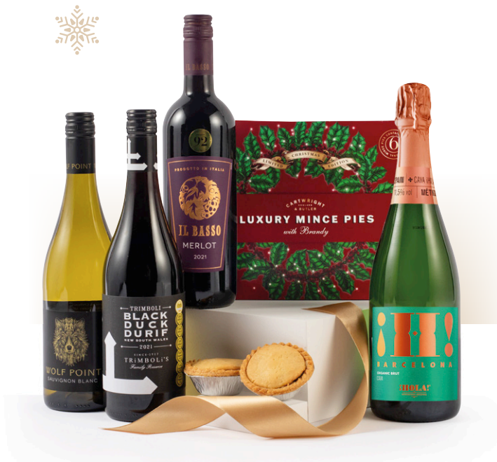
Luxury Mince Pies with Wine & Fizz £48 (in gift box)

*E-vouchers are despatched after payment has cleared; this takes up to 24 hours. Gift cards are posted same day if purchased before 1pm or next working day after that time.