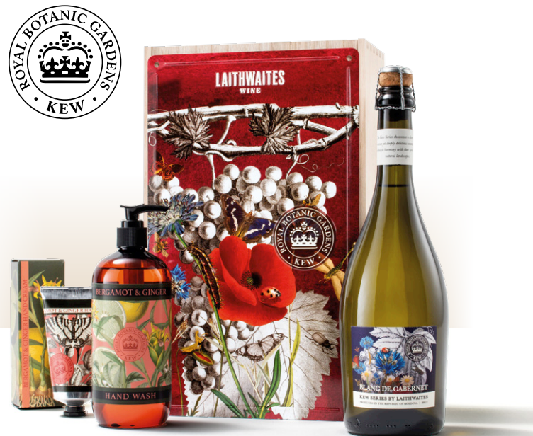
Kew Gardens Fizz & Hand-Care Set £40 (in wood/tin box)

This beautiful and unique gift features Royal Botanic Gardens, Kew, Bergamot & Ginger Hand cream and hand wash plus Kew Series by Laithwaites sparkling wine.