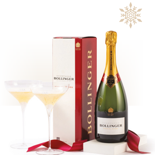
Bollinger Special Cuvée & Savoy Saucers £80