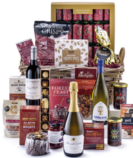
Christmas Tradition Hamper £150 (in wicker basket)

The Christmas Tradition hamper offers an abundance of festive treats – including a bottle of Prosecco, a bold Aussie red and a zippy Sauvignon Blanc – and that's just for starters.