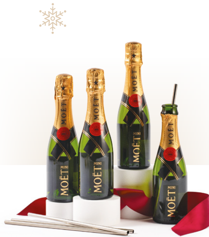
Mini Moët Champagne with Straws £59.99