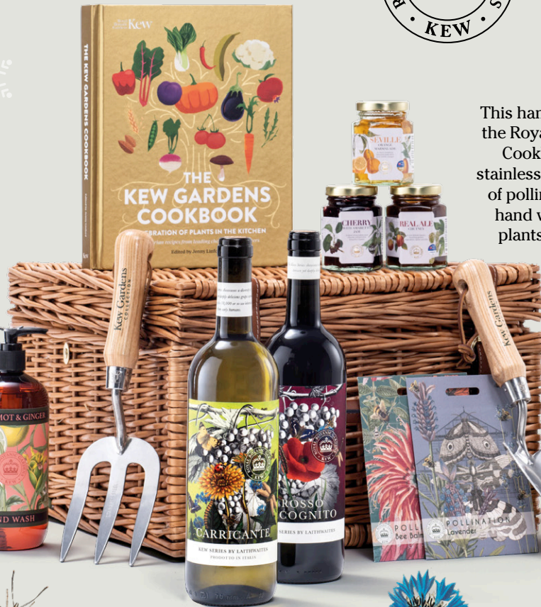
Kew Series by Laithwaites Hamper £200 (in wicker basket)

This hamper is crammed with beautifully designed gifts from the Royal Botanic Gardens, Kew. Alongside the Kew Gardens Cookbook, there's a gardening set (comprising a 5-inch stainless steel hand trowel and weeding fork plus two packets of pollinator-friendly seeds), a selection of tasty treats, and hand wash and hand cream inspired by the fragrances of plants in Kew's Collection. Not forgetting, of course, two delicious Kew Series by Laithwaites wines.