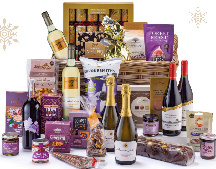
Pure Indulgence Hamper £250 (in wicker basket)

Chock-a-block with festive cheer, the Pure Indulgence hamper really does live up to its name. Two bottles each of Prosecco, Pinot Noir and Sauvignon Blanc are only the start.