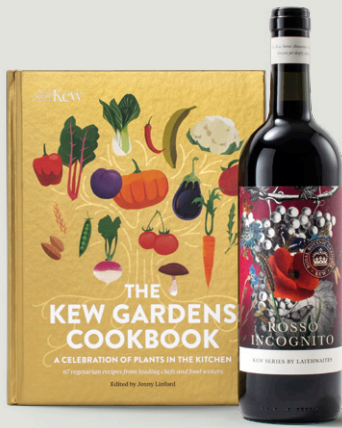
Kew Gardens Cookbook & Red Wine Gift Set £35 (in gift box)

Perfect for foodies and nature lovers. A collection of recipes from Royal Botanic Gardens, Kew, along with a supple red featuring the almost-forgotten Ancellotta grape.