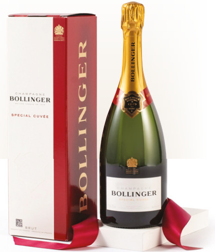
Bollinger Special Cuvée Brut NV £41.99