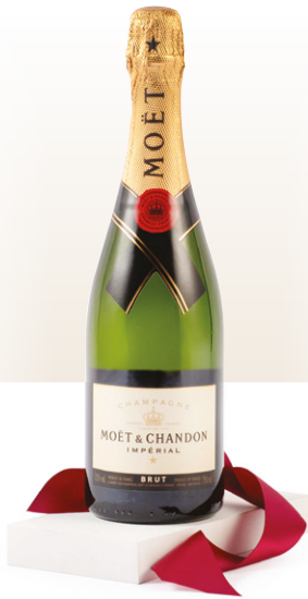
Moët & Chandon Brut Impérial NV £42.99

You don't need to be a Formula 1 champion to enjoy a bottle of Moët's Brut Impérial – it will make anyone feel special. Elegant and creamy with an alluring caress of fine bubbles.