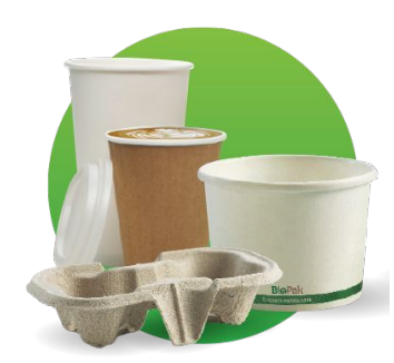
Paper BioCups & BioBowls