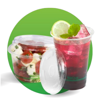
Clear BioCups & BioBowls