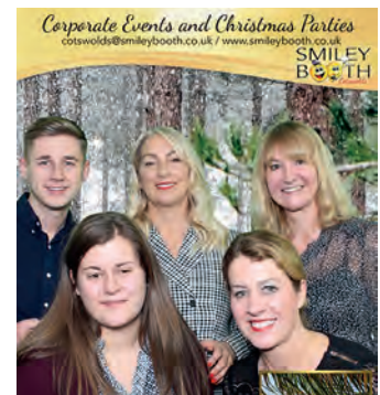
The C2S Team